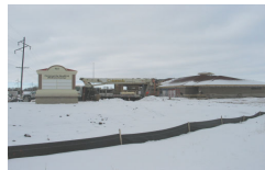
Under Construction: The new 15,200 sq. ft. Brillion Medical Arts Building

A new 37 acre business park was recently developed along State Highway 10 by a group of local investors called the Brilliant Development Group. Construction is already underway in the park with the new 15,200 sq. ft. Brillion Medical Arts Building that will house professional health care services for the area. In addition to the construction of the park, the city will be installing public utilities and streets in the park. The new business park has an excellent location and is also in a Tax Increment District (TID).