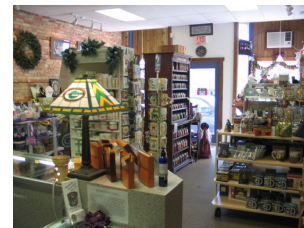
A look inside Personal Expressions in Chilton.